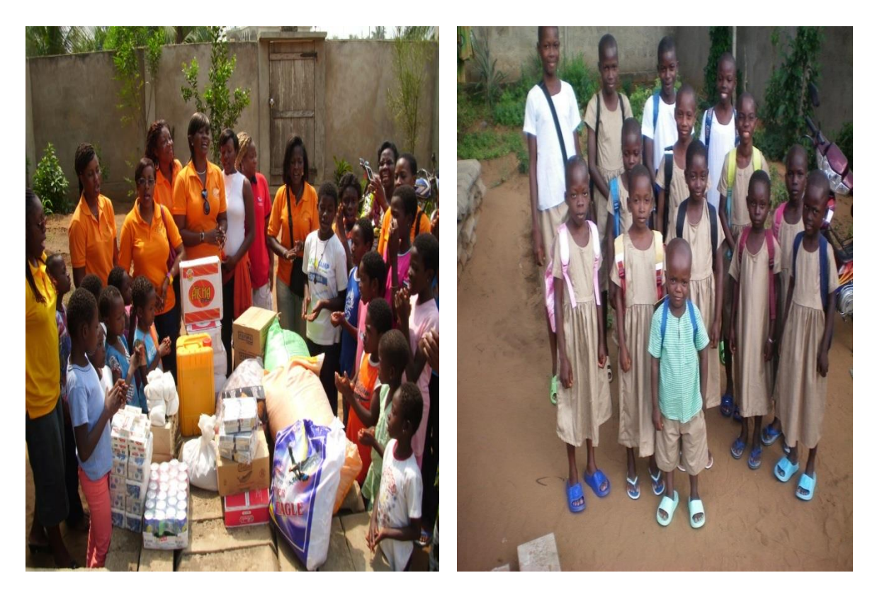
List of the orphan girls registered in Children's Home Of Sainte Thérèse D'agbata